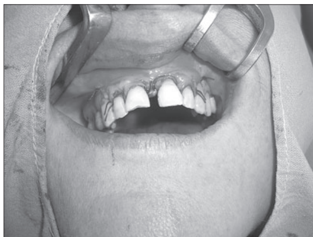
Fig. 7. Wound closure.