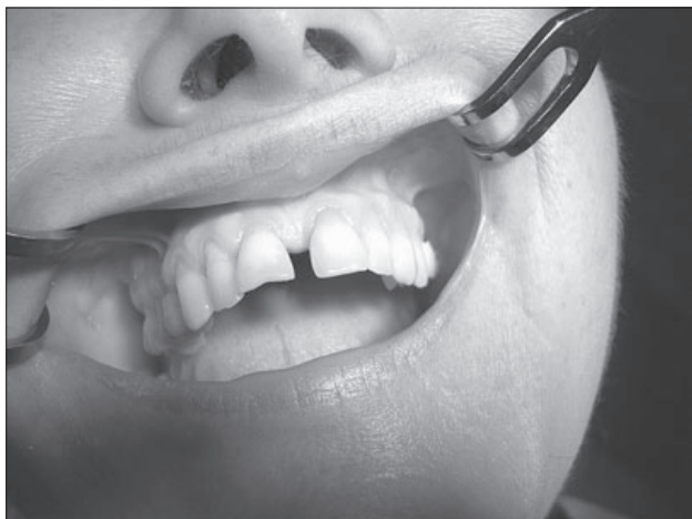
Fig. 1. Inflammation free status of the patient before surgery.