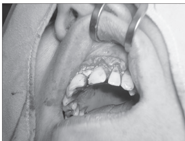
Fig. 5. Application of the graft material in to the wound.