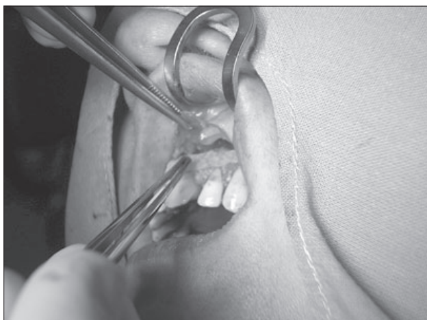
Fig. 6. Application of the collagenous membrane.